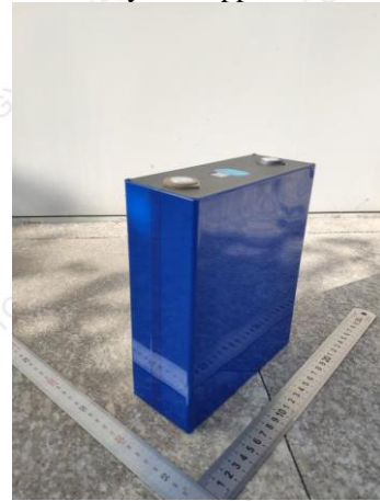
电池侧面外观 Battery side appearance