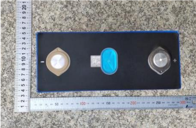
电池背面外观 Battery back appearance