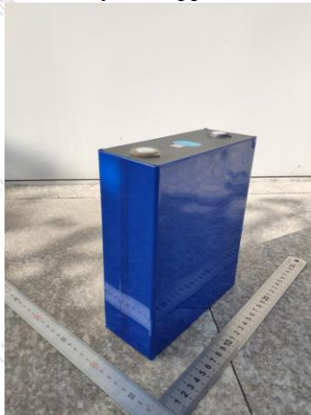
电池侧面外观 Battery side appearance