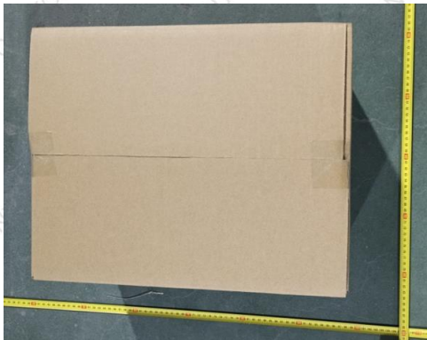
包装正面外观 Front appearance of Packaging