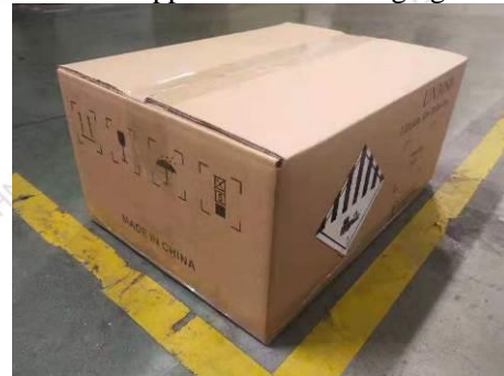
包装侧面外观 Side appearance of Packaging