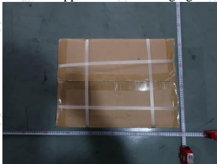
包装正面外观 front appearance of Packaging